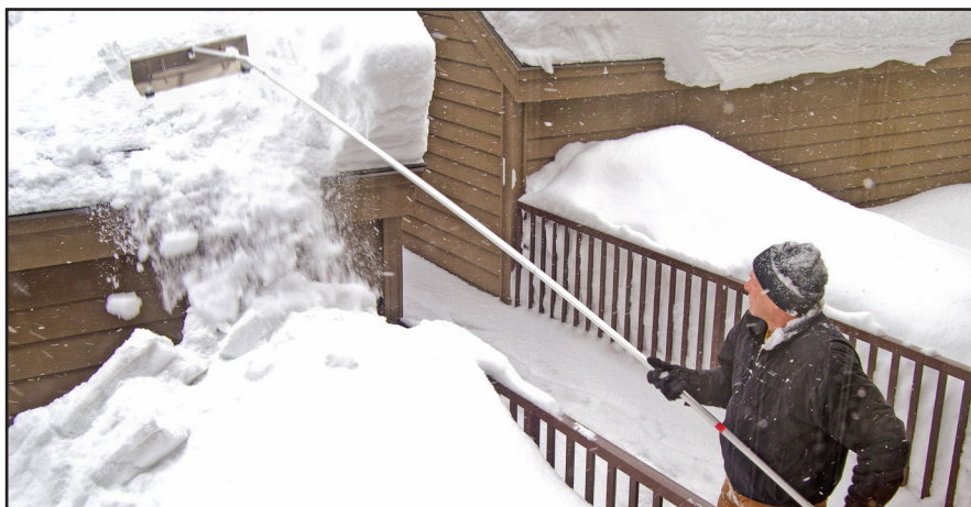
Figure 2 – Example of a roof rake being used to remove snow accumulation.

If you or your clients do not have the means to engage a professional service, they may want to consider using a roof rake. This tool can assist in the removal of snow from the roof while the operator stands safely on the ground.